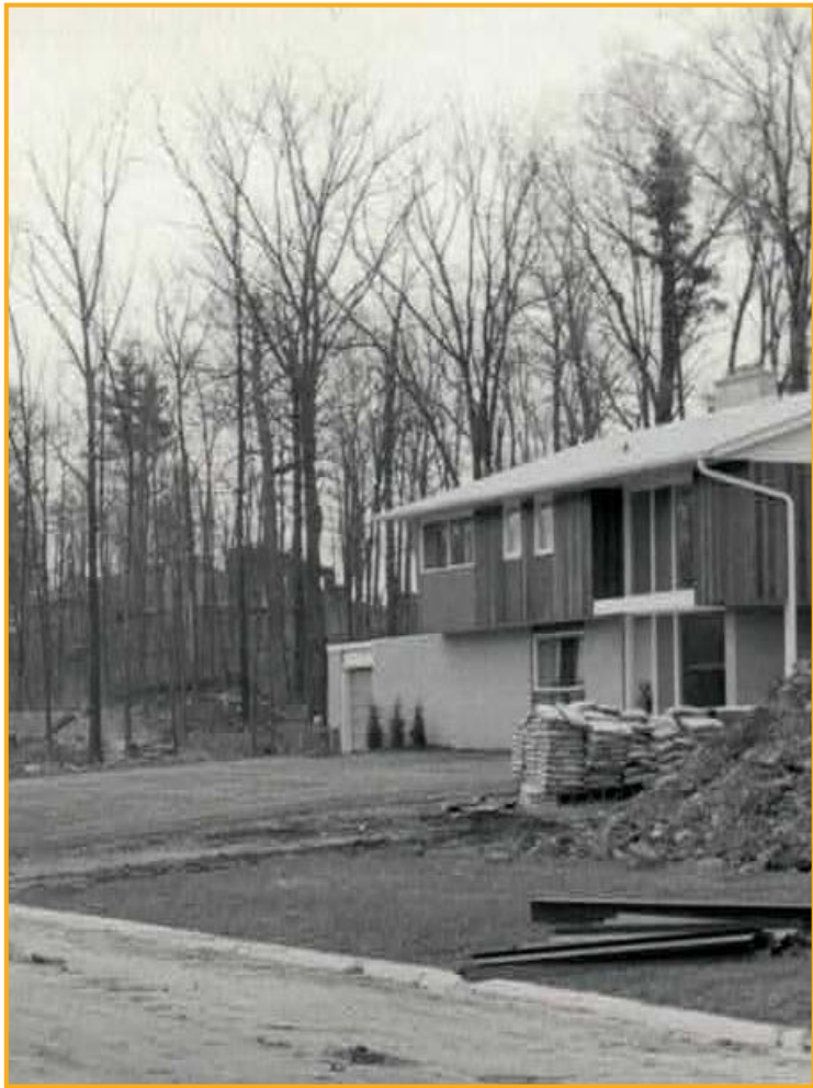
2442 Robin Drive under construction

This is a historical engraving of the Oliver Hammond House circa 1877 from the Atlas of Peel County. The view is facing towards the Credit River from Hammond.