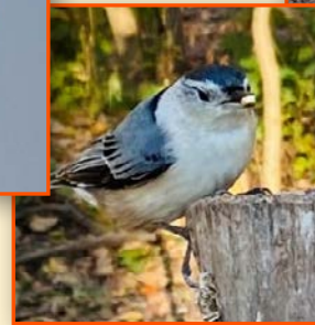
3rd Place Sanli Garkut