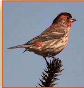
2nd Place Roger Tang